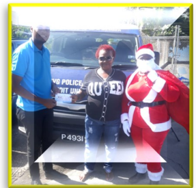
Random Acts of Kindness